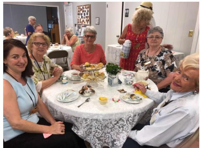
. . . as well as many of the women of the parish. . .