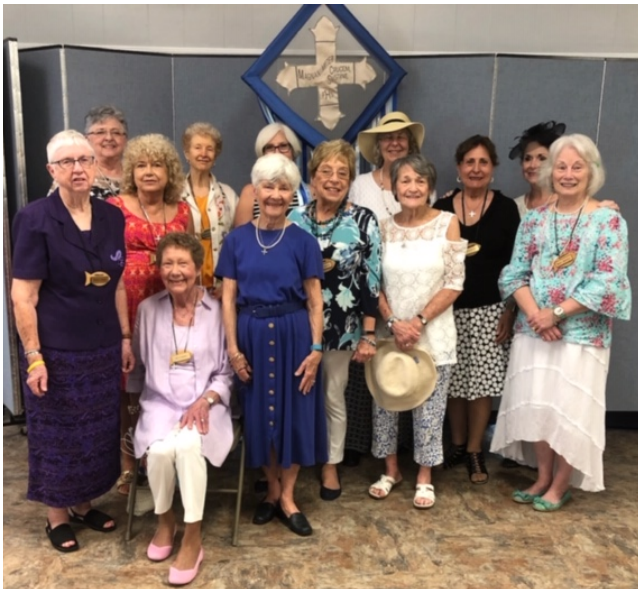
The 25 th Anniversary Tea was attended by many of the Mary and Martha Chapter members. . .