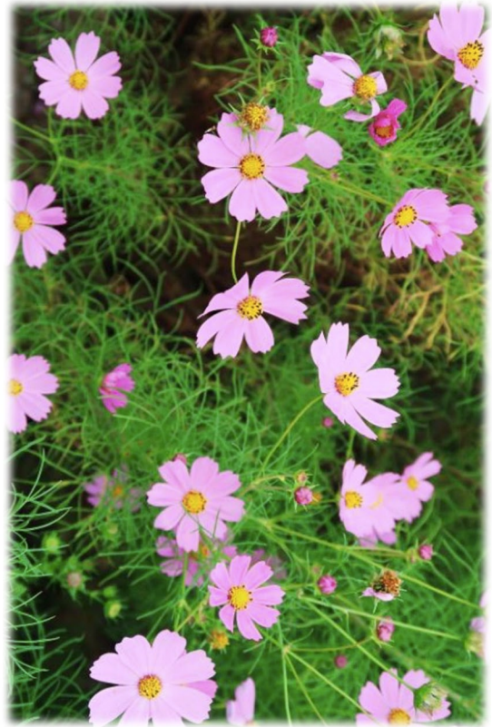
Pink Cosmos, said to represent order, balance & innocence. Blooms in a variety of colors, each with their own meaning: Red- love/passion; Pink - a mother's love; Yellow-freindship with White - devotion.

No one is surprised by the fact that we're reading less and less every year. There are so many alternatives competing for our attention: smartphones, television, movies, all sorts of electronic media. For me, there's nothing better than sinking into a good book, but to find one (and the bestseller lists often disappoint) sometimes you have to step outside of your comfort zone. During this Polish American Heritage Month , you might want to do just that. To this end, I have placed a copy of Polish Mother in the Bliss Hall Library , if you'd like to check it out.